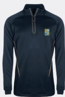
1/4 Zip PE Top