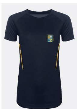
Girls PE Top