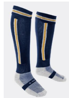
College football socks

Navy and white football socks (Instead of the College football socks)