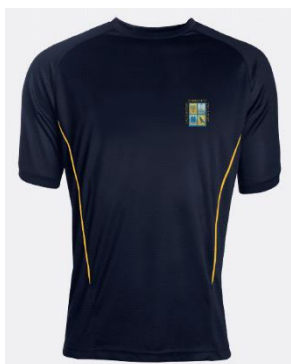
Boys PE Top