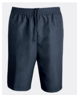
Navy PE shorts