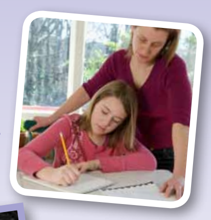
6. If they are right, ask how they will remember it in the future